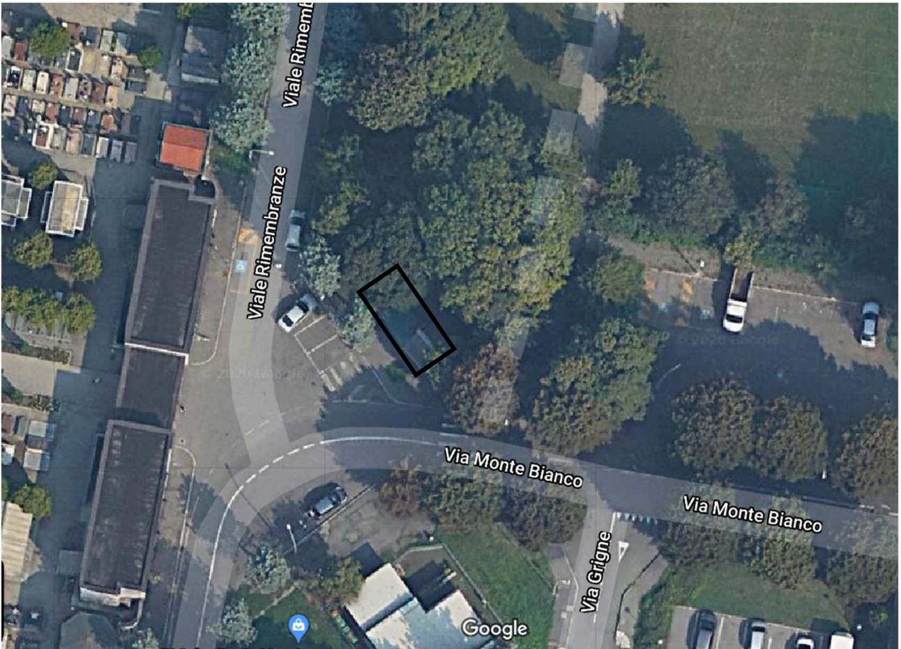
Ortofoto con evidenziata l'area interessata