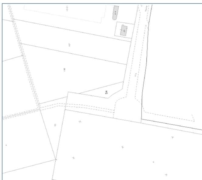
Planimetria catastale fg 5 mappale 54